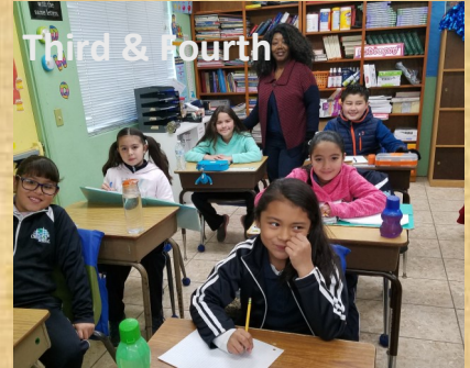
Third & Fourth