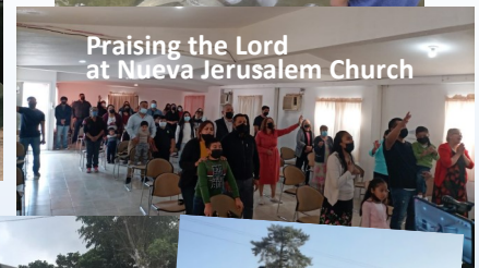
Praising the Lord at Nueva Jerusalem Church