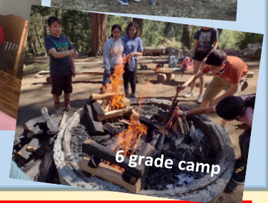
6 grade camp

We want to thank everyone who responded financially to the opportunity of giving in remembrance of and gratitude for 60 years of ministry which we have offered to the Lord. We want to continue to work together with you for the King-