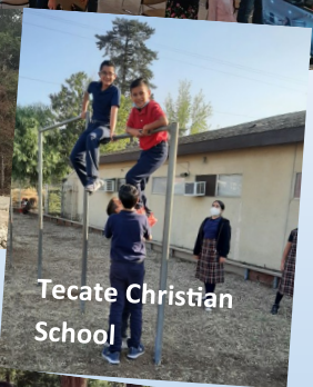
Tecate Christian School