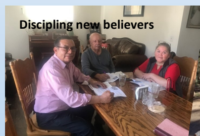
Discipling new believers