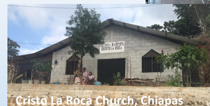
Cristo La Roca Church, Chiapas