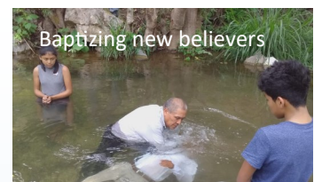
Baptizing new believers