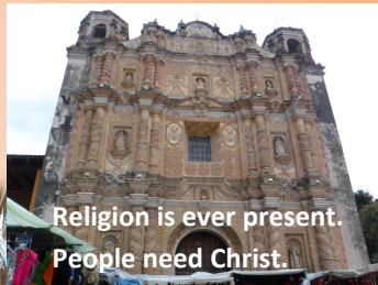
Religion is ever present. People need Christ.