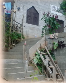
TMI Church in Brasil, Chiapas, Mexico