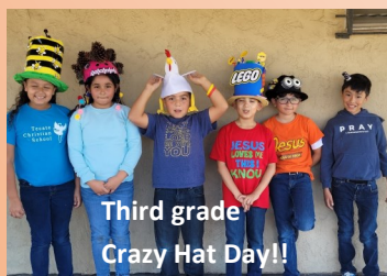
Third grade Crazy Hat Day!!

In the classroom the day includes prayer and the teaching of the Word of God. However, the teachers seek to give excellent training in all the academic subjects. Sometimes students are tutored in problem areas such as Math and