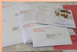
Bible Correspondence study lessons