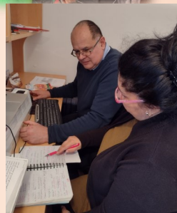
Translating the Scriptures

These are only a very few of the areas which the Good News is being shared by TMI missionaries in different parts of the world. Pray for all that is done in the coming months might glorify our Creator.