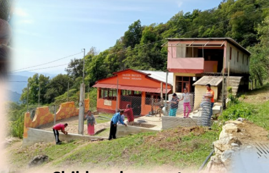
Maranatha Church in the mountains of Oaxaca