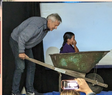
Biblical teaching TCS assembly