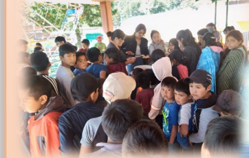
Outreach for Christ in Michoacán, Mexico