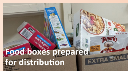
Food boxes prepared for distribution

People donate food, clothing, household goods and more to be shared with churches and individuals. It is a blessing to know that continually 100's of people are helped with these items. Our sincere thanks to you who give, those who come to assist in the preparation of the boxes and for those who distribute to those in need. It is a team effort!