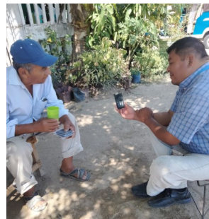
Sharing the Huave Bible on audio